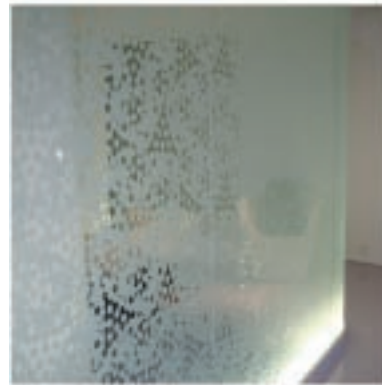
Hydrangea 2003 Gala for "Mythos nail and foot care" Omote-sando Tokyo.jp Interior designed by Naoki Terada