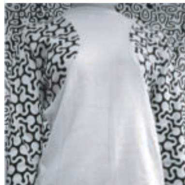
nest GARA shirts 2004 With Fashion Designer K Satoshi